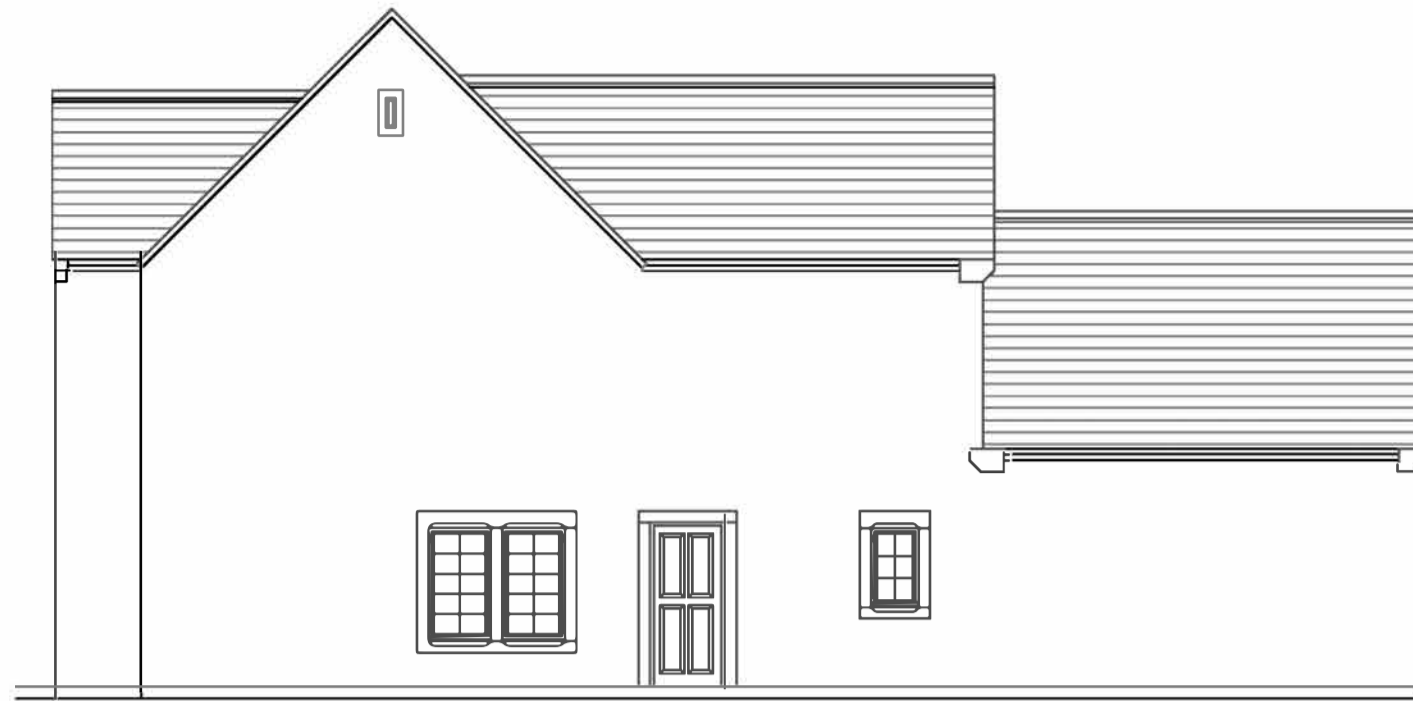
Typical (Type 1) Side Elevation Scale 1:100