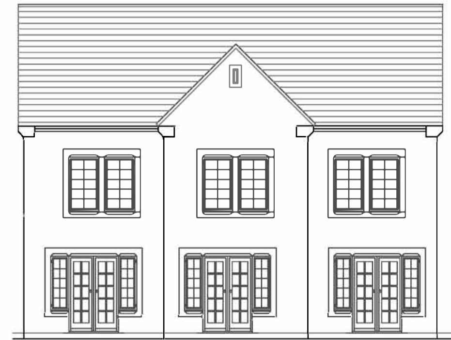
Typical (Type 1) Rear Elevation Scale 1:100