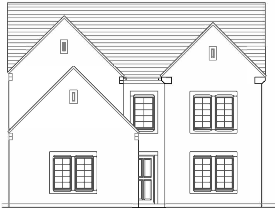
Typical (Type 1) Front Elevation Scale 1:100