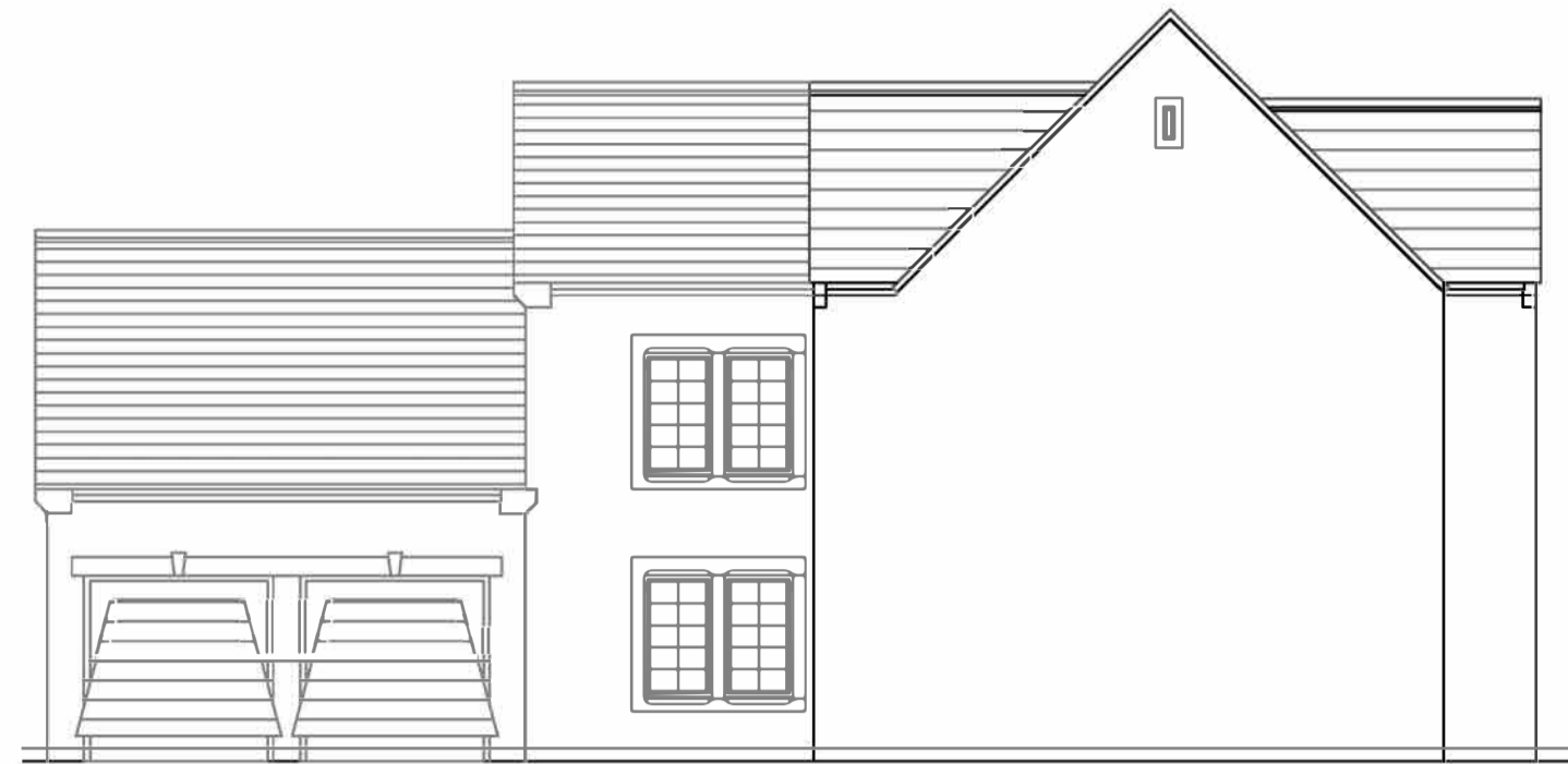
Typical (Type 1) Side Elevation Scale 1:100